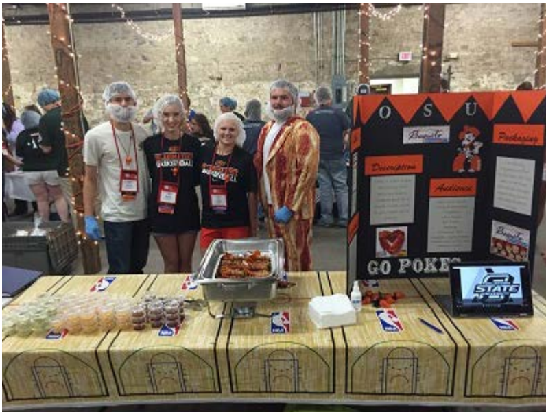
University T-Shirt Competition

Again this year the t-shirt auction was an exciting and memorable event thanks to our amazing members! The Champion T-shirt went to Iowa State University ; their t-shirt was purchased for $6,000 by Iowa State. We want to thank all the universities that submitted T-shirts this year and to everyone who helped us raise $8625 with a portion of the proceeds going towards the AMSA Educational Foundation Chris Raines Memorial Fund and the remaining proceeds will go to fund future Student Leadership Activities.