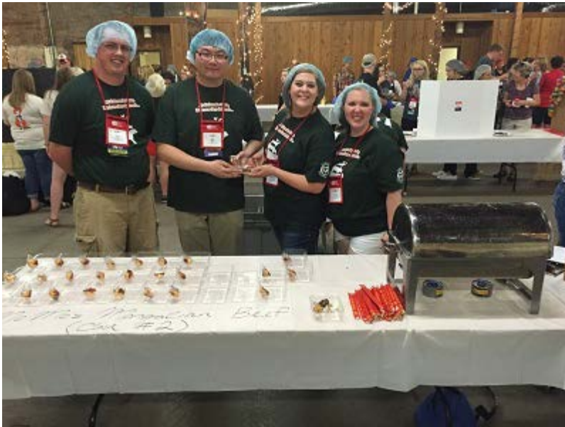
People's Choice Award: Oklahoma State University – Baquito